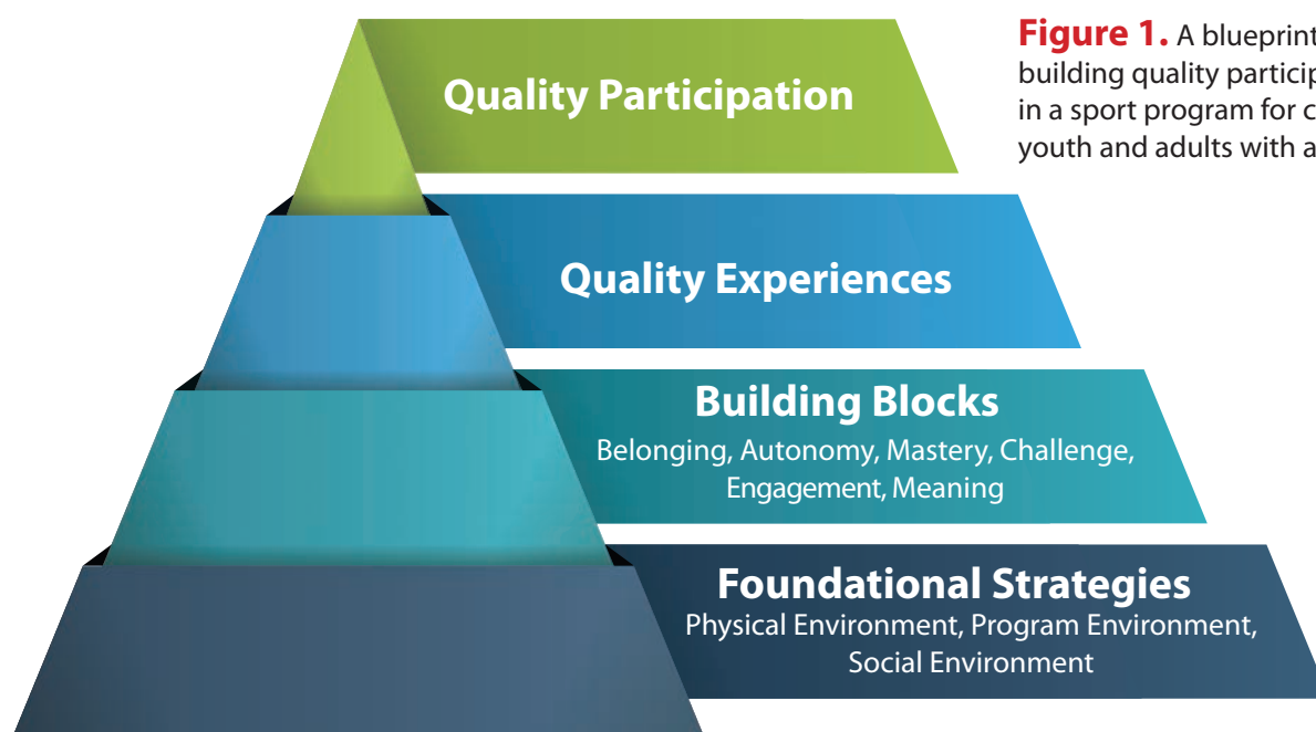
Figure 1. A blueprint for building quality participation in a sport program for children, youth and adults with a disability.

Quality participation is achieved when athletes with a disability view their involvement in sport as satisfying and enjoyable, and experience outcomes that they consider important.