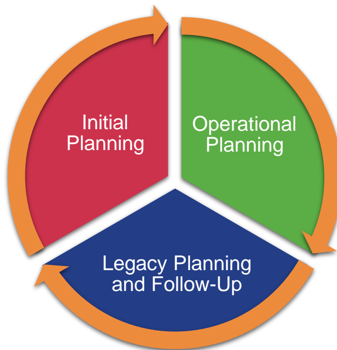
Figure 1. Three Phases of Planning a Volunteer Program.